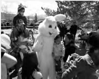
2009 Easter Egg Hunt!

ALL WATERING IS RESTRICTED BETWEEN 12:00 NOON AND 4:00P.M. Penalties and fines for violations will be imposed. 1 st violation is an oral or written warning, 2 nd violation is a warning by certified mail and the 3 rd violation is water will be shut off and a $50.00 fine. Waste of any kind is prohibited at all times.