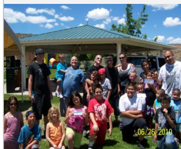
Summer kick-Off Contest winners

REMINDER: Bills are due the last business day of each month no later than 4:00PM. The drop box is checked promptly at 4:00. If your payment is not there you will be charged a late fee.