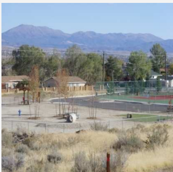
Indian Hills Dog Park

The IHGID Board normally meets once a month on the Third Wednesday of each month at 6:00, in the Board Room at James Lee Park. The public is encouraged to come and stay up to date on changes within the district. For more information about the Board Meeting or to be added to our agenda mailing list please contact the office.