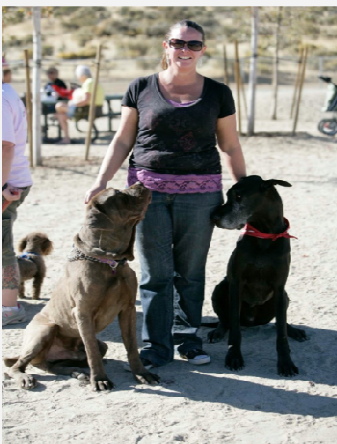
2011 Canine Extravaganza

We encourage you to visit our new and improved website at www.indianhillsnevada.com for the latest Pipeline Updates, News and Events.